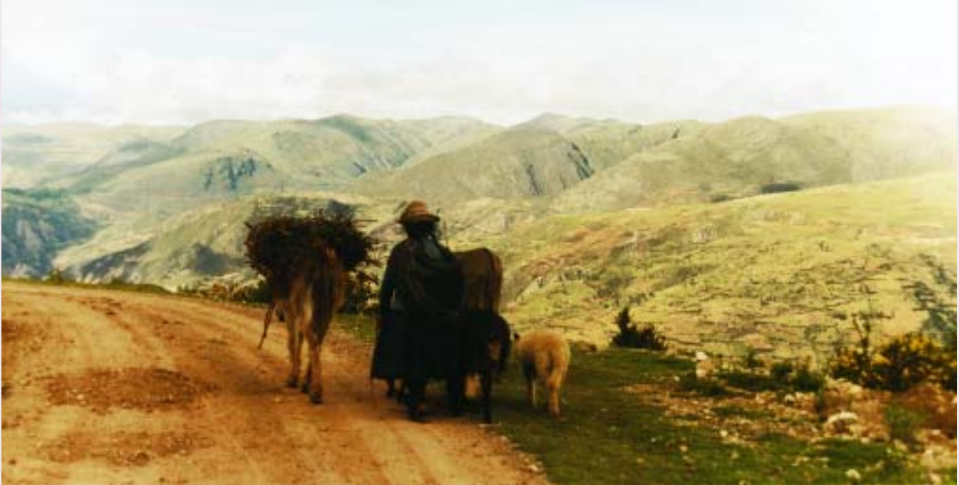
FIGURE 2 A local woman uses a rehabilitated rural road to do household work in Huancavelica.