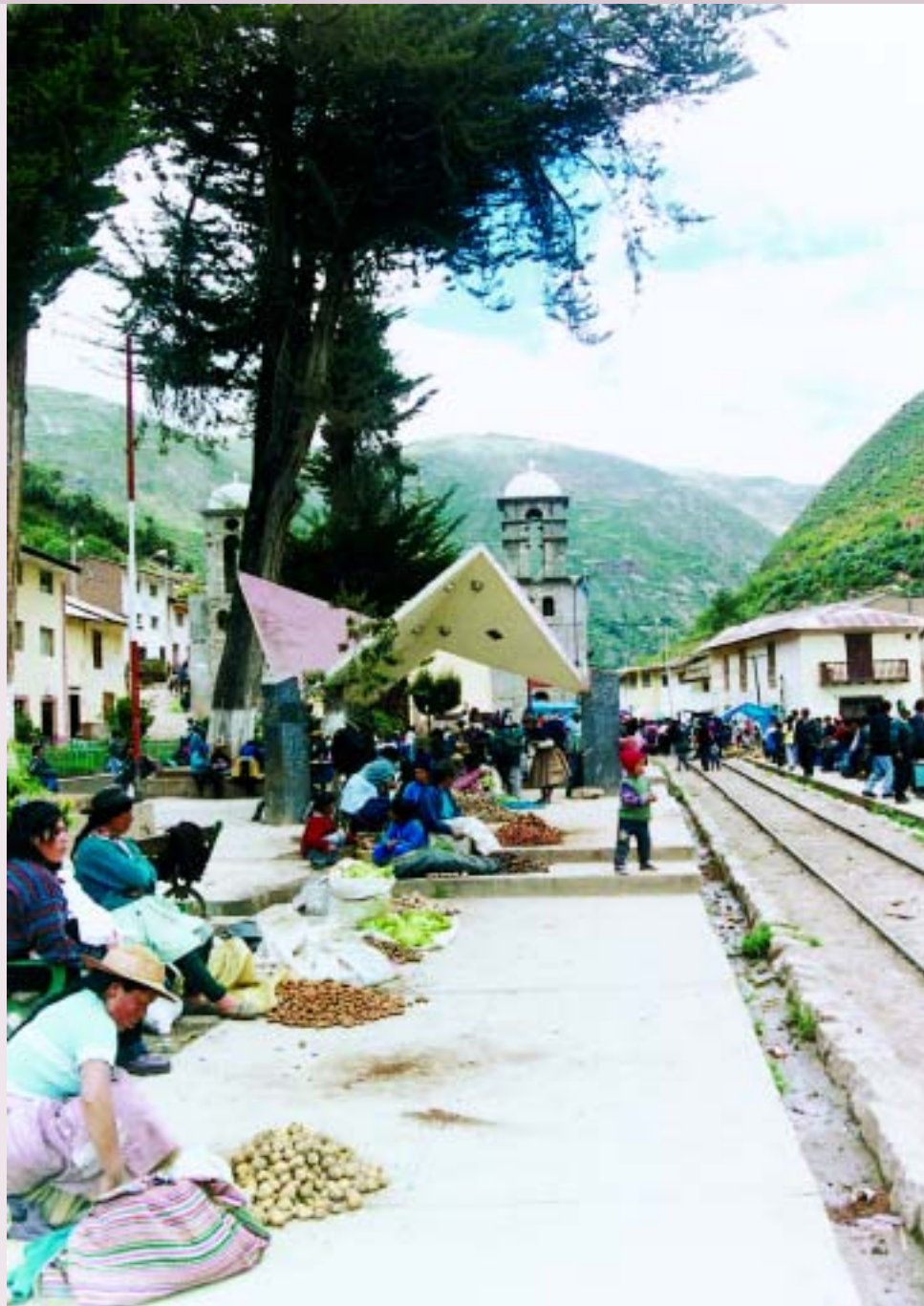
FIGURE 1 Access to markets and mobility are made possible for isolated communities in rural areas by infrastructure such as this railway line in Izcuchaca, Peru.

Experience has shown that roads alone do not have a great impact on poverty alleviation. Transport infrastructure programs now pay greater attention to affordable transport services and intermediate means of transportation, components that are considered important in providing mobility for the poor, especially in rural areas (Figure 1). But there are additional lessons to be learned in the transport sector. An efficient and equitable strategy of poverty reduction must be based on a full understanding of the gendered nature of poverty. The transport burden faced by women contributes to poverty in terms of time. Lack of time is a key constraint on the ability of women to build their assets and reduce their vulnerability. By reducing the burden of transport, development projects can increase women's productivity and income and also enhance their assets. This would also give women more time to rest, enjoy social life, and participate in community activities. Fernando and Porter (2002) found that facilitating mobility can empower women to gain greater control over their own lives by increasing their access to markets and their exposure to education, training, and information and by offering them more opportunities for political participation.